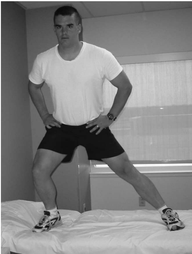
Fig 5. Example of a core-strengthening exercise in a sports program: here, the lunge is performed on a labile surface.

Research 40 shows that a few essential ingredients can enhance neuromuscular control. These components include joint stability (cocontraction) exercises, balance training, perturbation (proprioceptive) training, plyometric (jump) exercises, and sports-specific skill training. All these regimens should be preceded by a warmup. Perturbation programs, described by Caraffa et al, 40 feature exercises that challenge proprioception via wobble boards, roller boards, disks, and physioballs. These programs work at the afferent portion of the neuromuscular control loop and provide stimulation of different proprioceptors. In a prospective study, Hewett et al 41 developed a plyometric jump training program that reduced knee injuries in female athletes. Plyometric training emphasizes loading of joints and muscles eccentrically before the unloading concentric activity. Plyometrics use the biomechanical principles of triplanar pronation and supination. Pronation is a physiologic