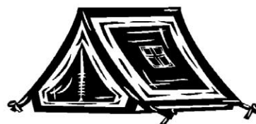
Fig 1. Muscular cocontraction via the thoracodorsal fascia produces active stability, similar to the support that guy ropes provide to a tent secured against the wind. Adapted with permission from Porterfield and DeRosa. 5

The hip musculature plays a significant role within the kinetic chain, particularly for all ambulatory activities, in sta-