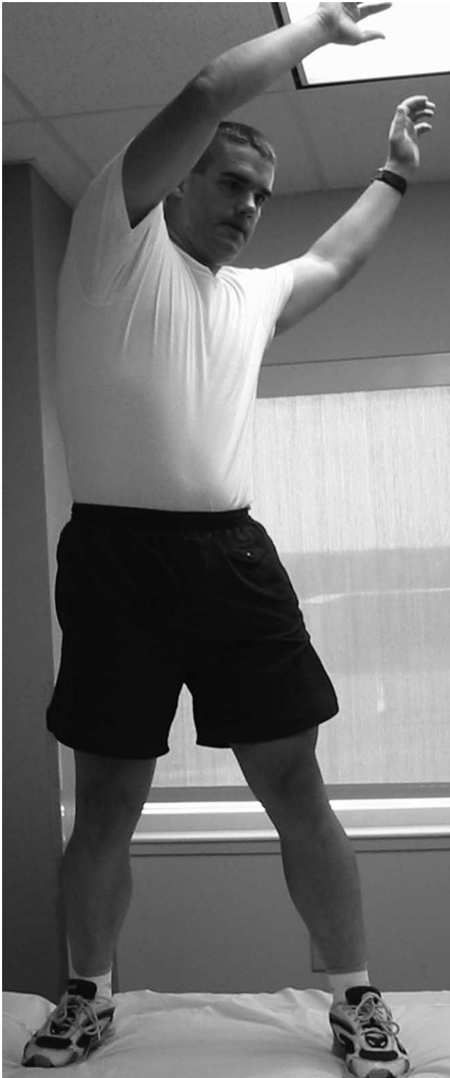
Fig 2. Example of a movement awareness exercise: here, external oblique muscles are activated with a controlled trunk twist.

bilization of the trunk and pelvis, and in transferring force from the lower extremities to the pelvis and spine. 16 Poor endurance and delayed firing of the hip extensor (gluteus maximus) and abductor (gluteus medius) muscles have previously been noted