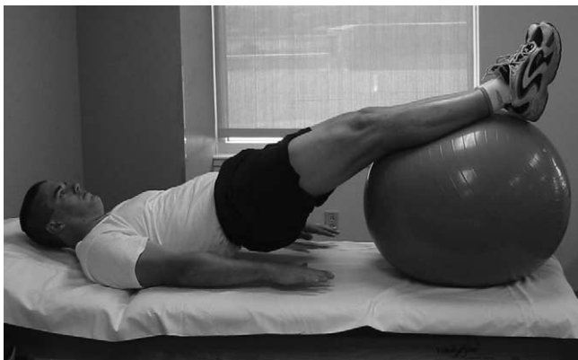
Fig 4. The pelvic bridging exercise performed with a physioball.

to the standing position. This shift, in addition to increased hip flexor activity (such as with sitting at the edge of a chair), causes increased compressive loads on the lumbar spine. 14 Education on proper sitting and standing ergonomics, along with so-called “movement awareness” exercises, also have been advocated by some to thwart LBP. 32 Juker et al 15 performed a seminal study on quantitative electromyographic activity with different positions and exercise. Although quiet standing requires little electromyographic activation of core musculature, sitting with an isometric twist or sitting with hip motion produces more activation of core musculature. Core musculature should be trained to endure these functional activities.