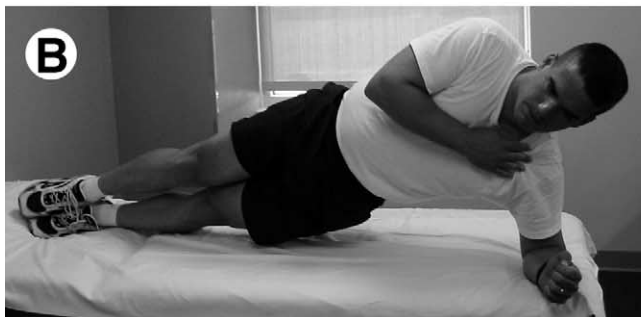
Fig 3. The basic exercise triad for most stabilization programs consists of the (A) curl-up, (B) side bridge, and (C) bird dog exercises.